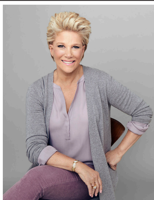
Joan Lunden will be the keynote speaker at Aging Summit 2018

and medical care at the forefront. However, older adults bring great strength to our communities too, and play an essential role in their vibrancy and cohesiveness.